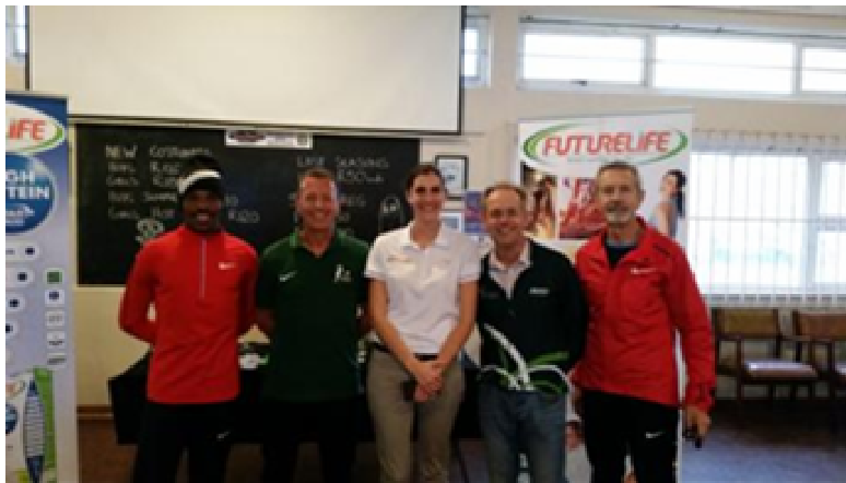
Start of the Time Trial